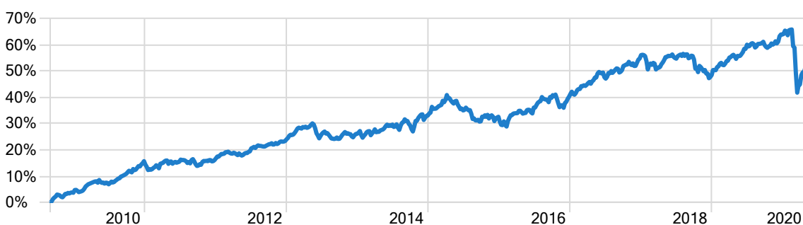
— Newscap Cautious