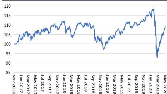
Share Class B Acc GBP from 28/11/2016 to 31/05/2020