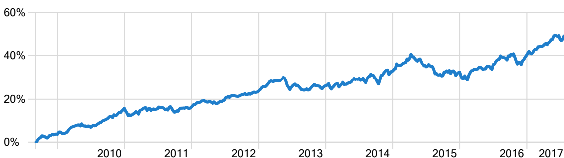
— Newscap Cautious