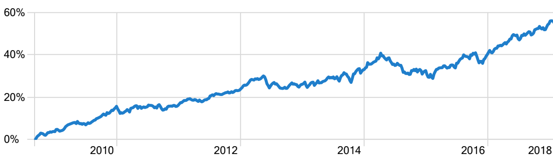
— Newscap Cautious