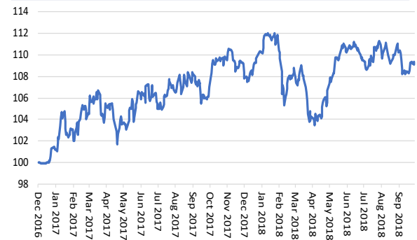
Share Class A Acc GBP from 28/11/2016 to 30/09/2018 Fund data as at 30 September 2018