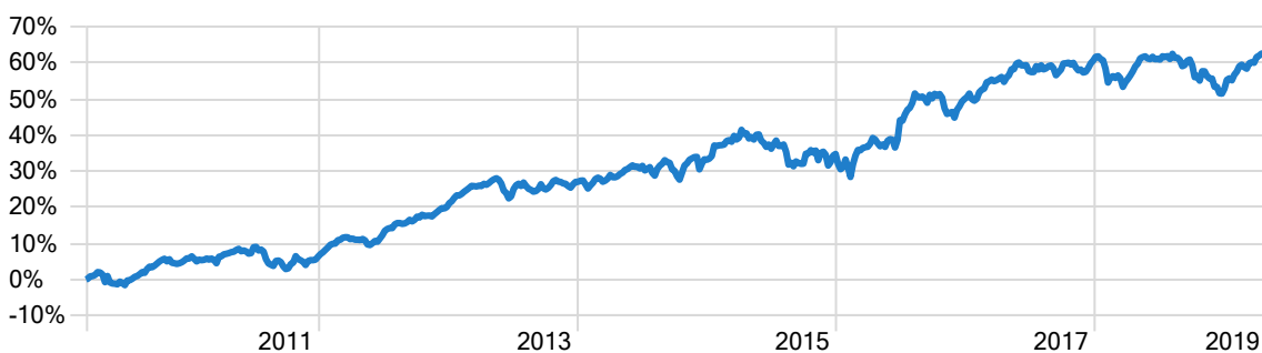
— Newscap Income