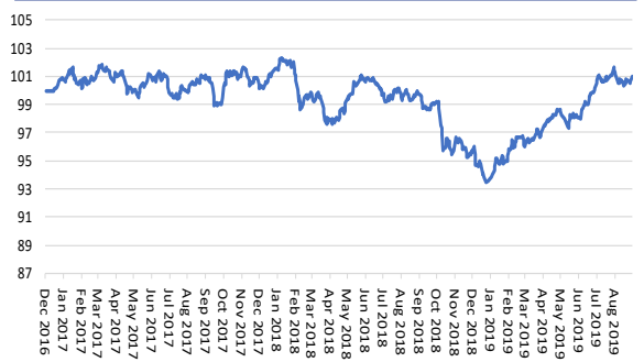
Share Class B Acc GBP from 28/11/2016 to 31/08/2019 Fund data as at 31 August 2019