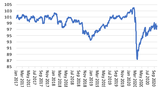
Share Class B Acc GBP from 28/11/2016 to 30/09/2020