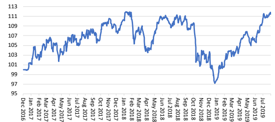
Share Class B Acc GBP from 28/11/2016 to 31/07/2019 Fund data as at 28 June 2019 Source: Newscap Capital Group